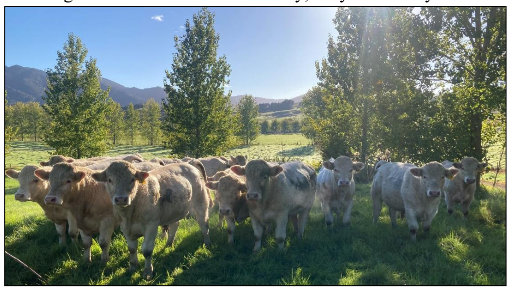
2024 Charolais Sale Bulls on offer.